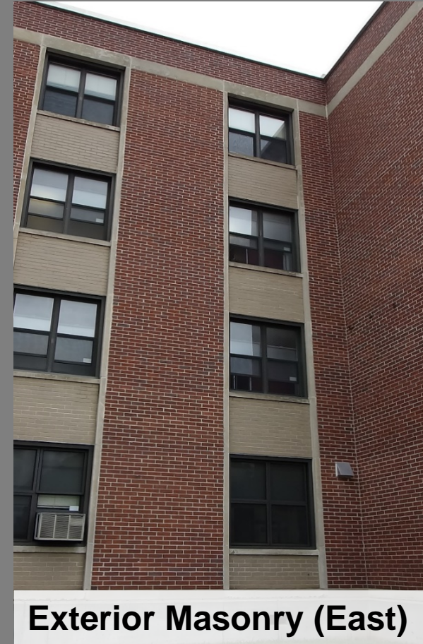
Exterior Masonry (East)

Demolition of Monteith Hall, Building 0008