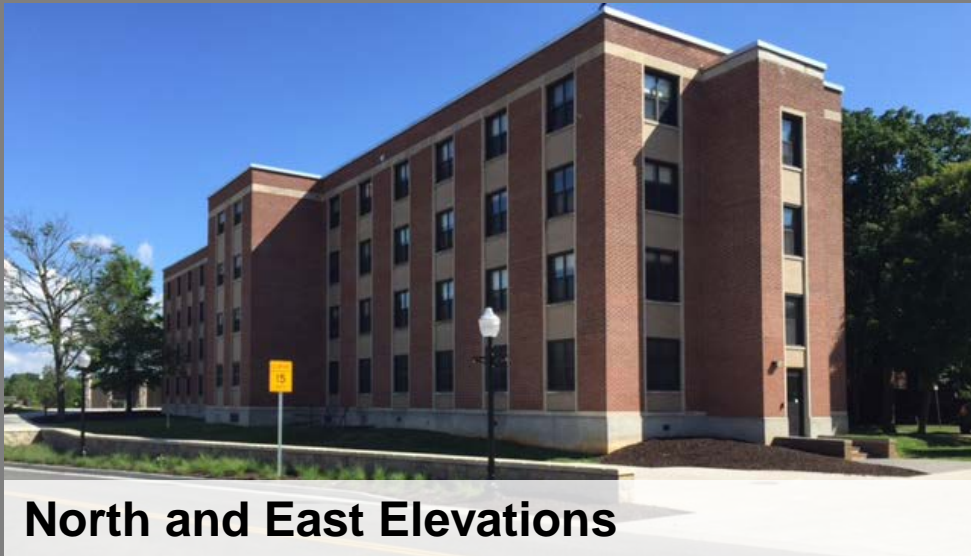
North and East Elevations